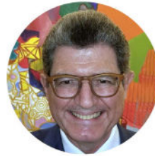
Mr. Joaquim Levy Brazil