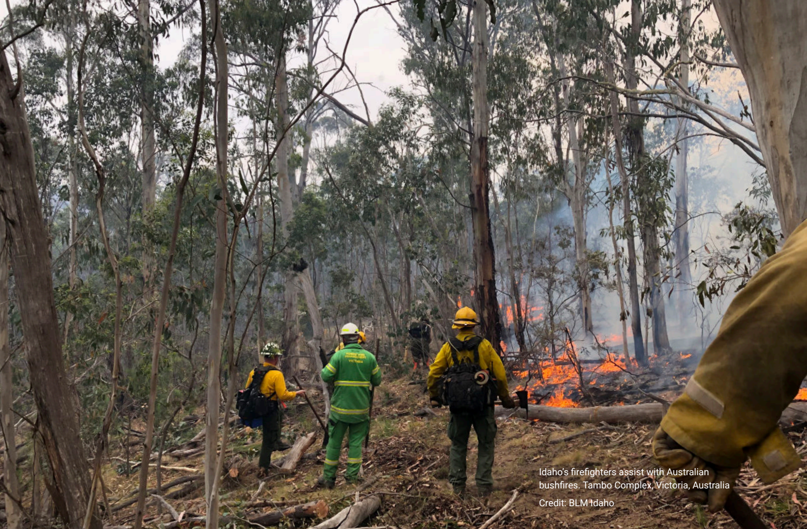
Idaho's firefighters assist with Australian bushfires. Tambo Complex, Victoria, Australia