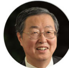
Dr. Zhou Xiaochuan China